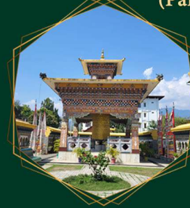
Samdrup Jongkhar (Bhutan Border)

(known as Manchstar of the East and famous for Assam Silk handloom industry)