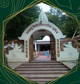
Doul Govinda Kamrup, Assam