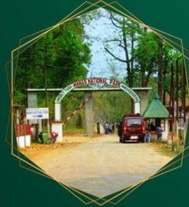
Manas National Park