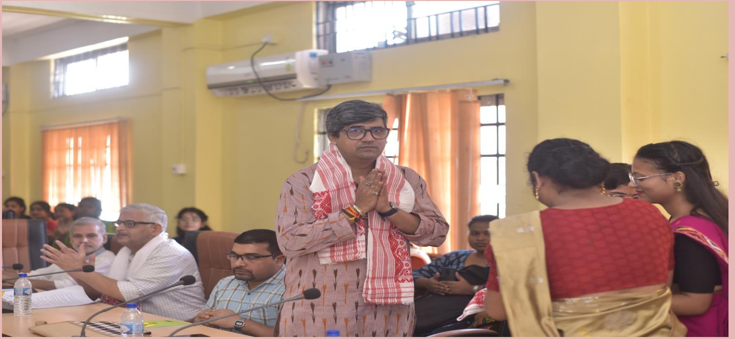
Felicitating Resource Person of technical session-V of the National Conference