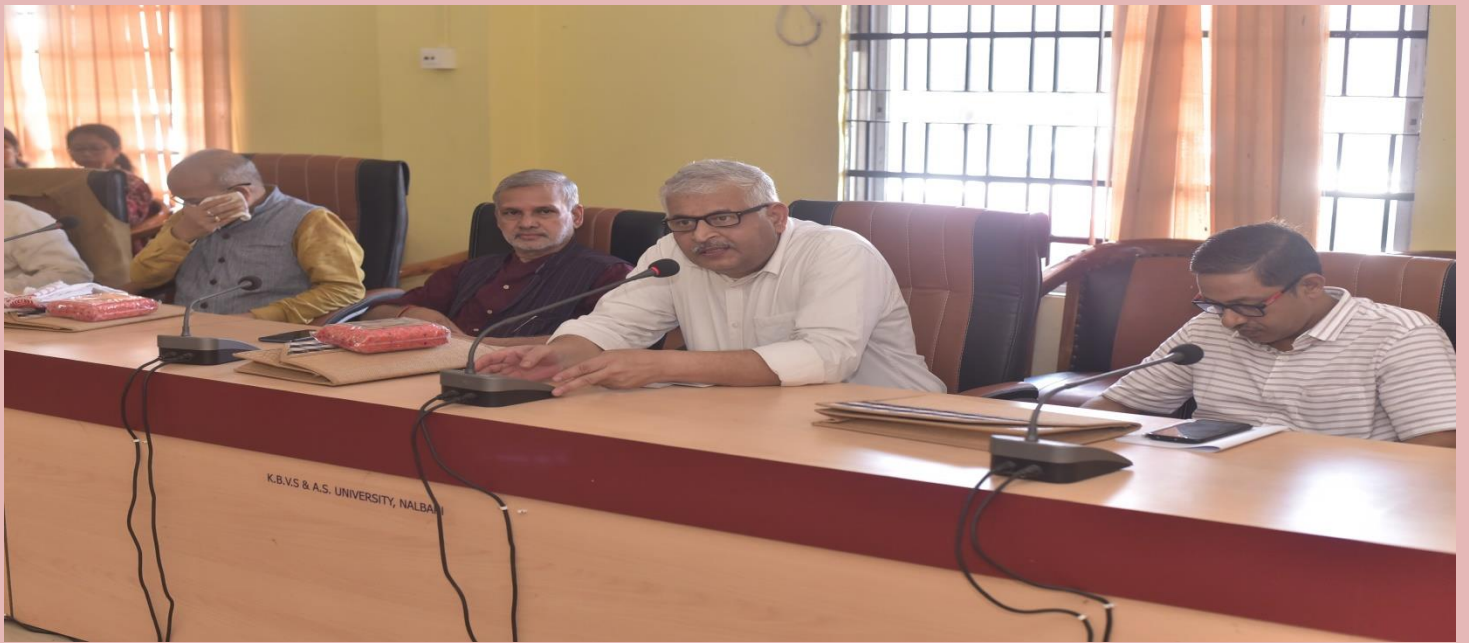
Speakers deliberating in the Plenary Session of the National Conference