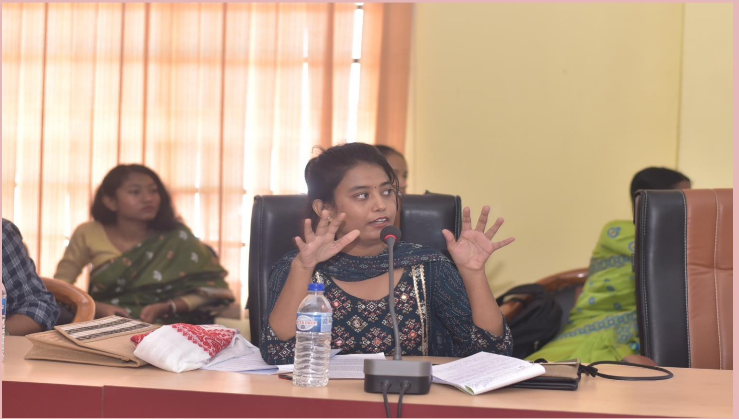
Panelist presented their part during the technical session III of the Conference