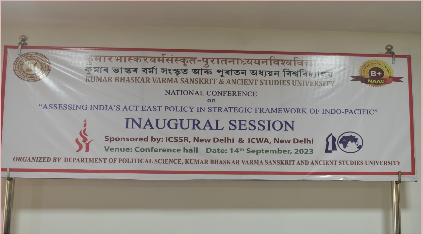
Inaugural Session of the National Conference dated 14th September, 2023