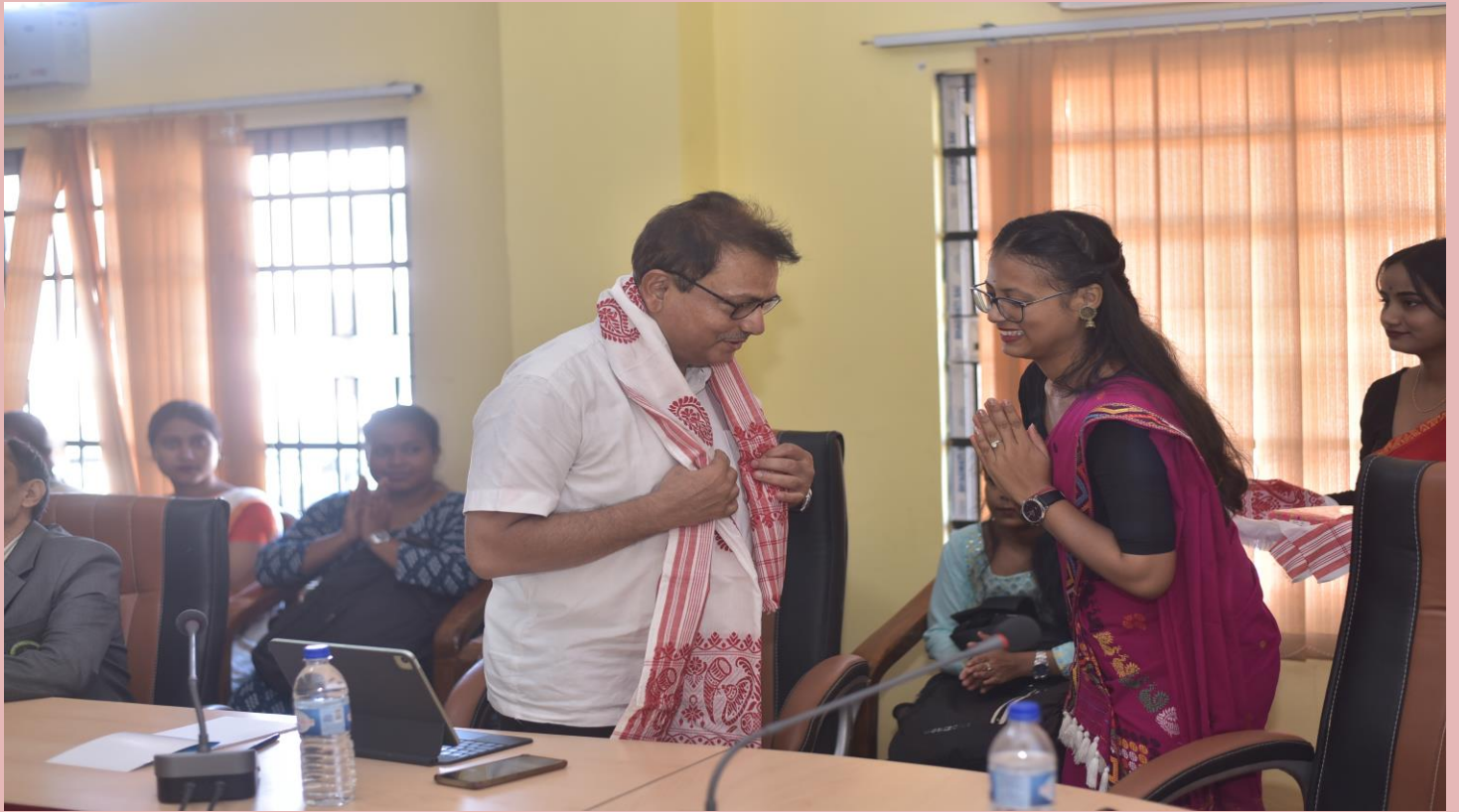
Felicitating the Chairperson of the Technical Session III of the National Conference