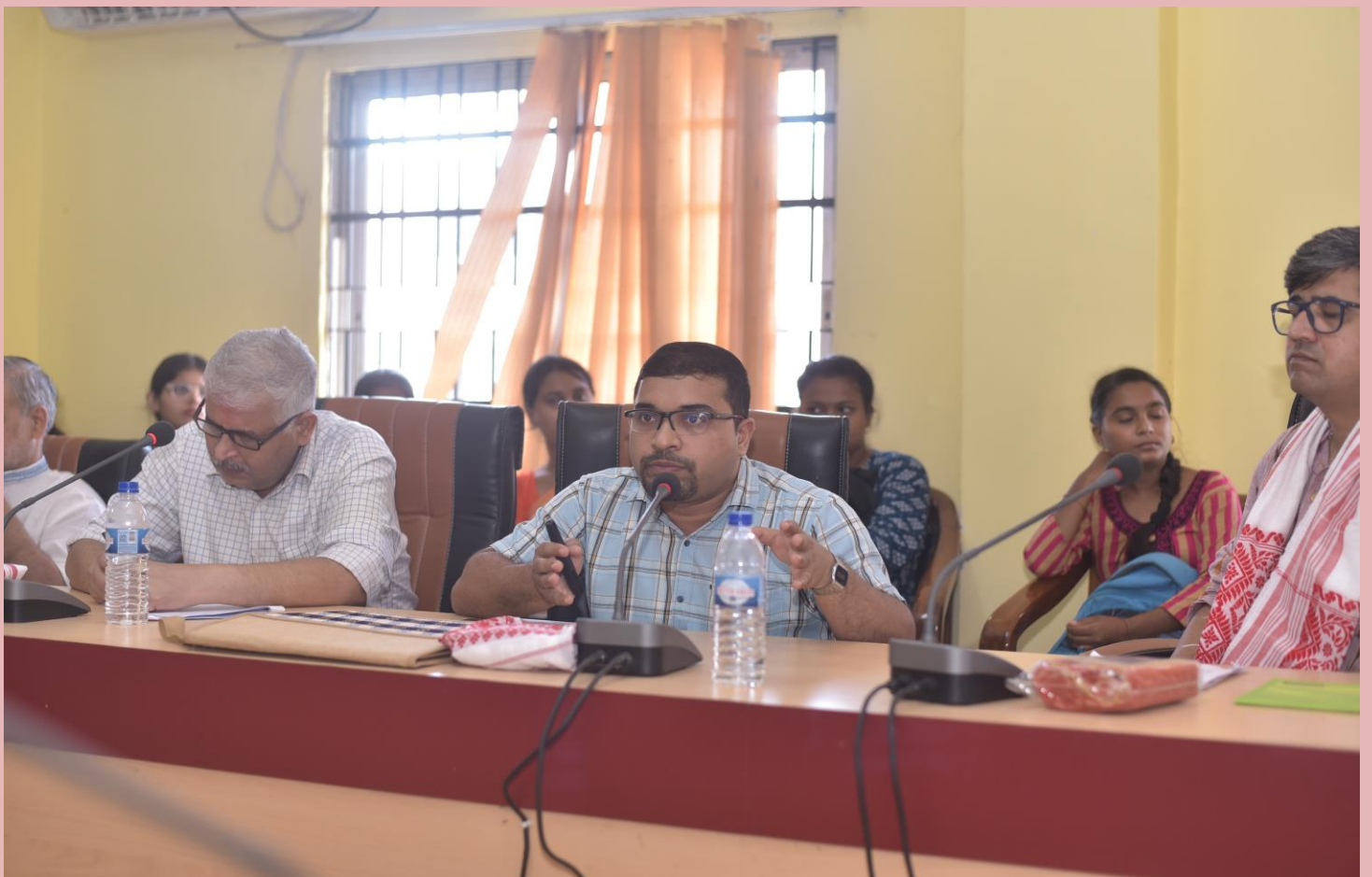
Panelist presented their paper during technical session-V of the Conference