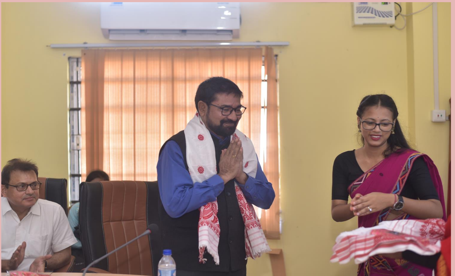
Felicitating the Resource Person of the Technical Session III of the Conference