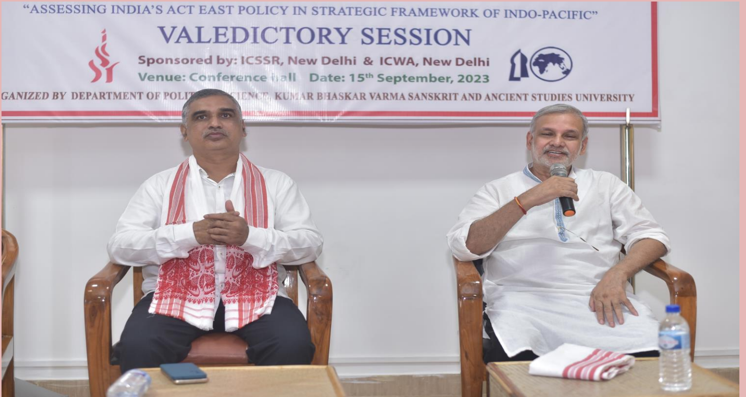
Hon'ble Vice Chancellor along with the Valedictory Speaker