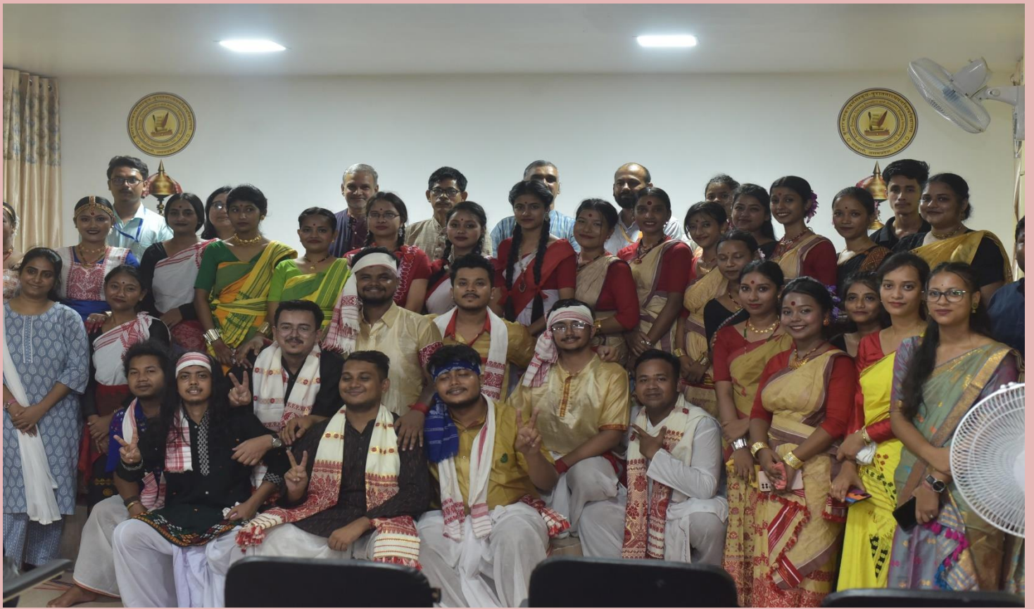
Cultural team with Honourable Vice Chancellor of the University