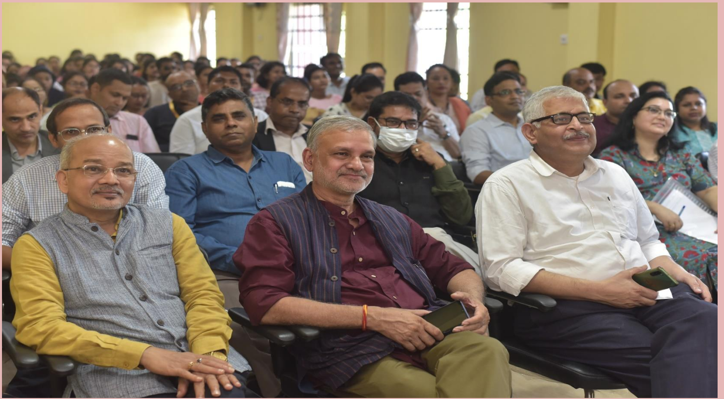
Invited Dignitaries and the learned gatherings in the National Conference