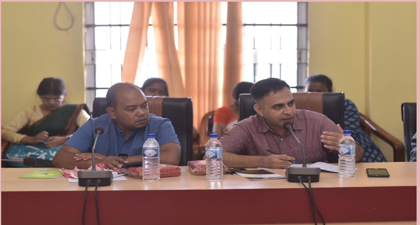
Chairperson and discussant of the technical session-IV of the Conference