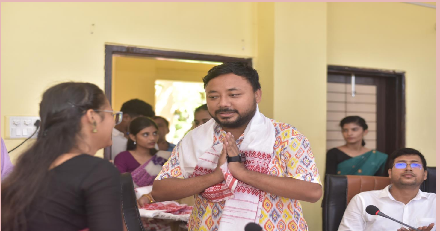
Felicitation of the Panelist during technical Session-IV of the Conference