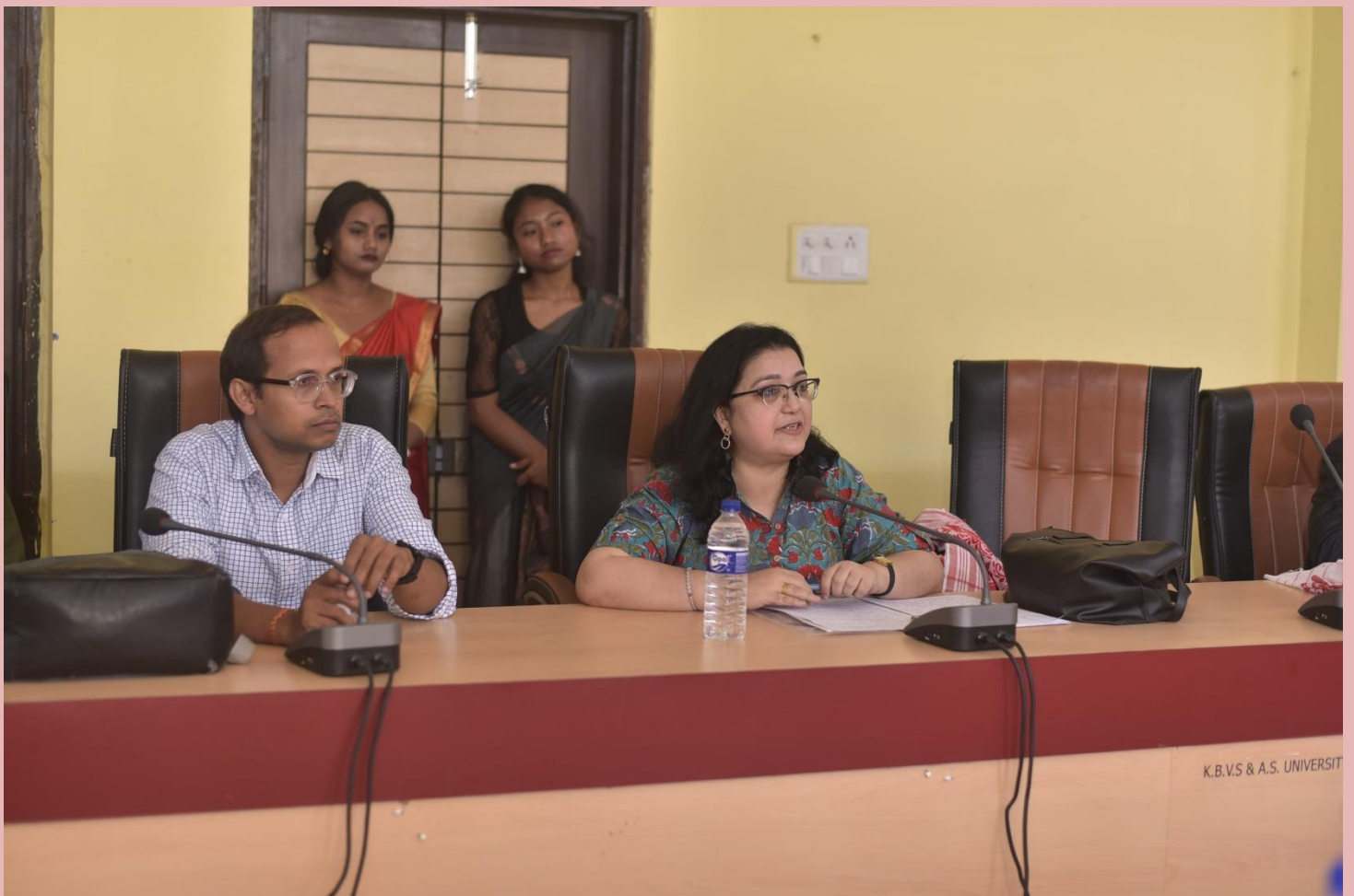
First Technical Session of the National Conference