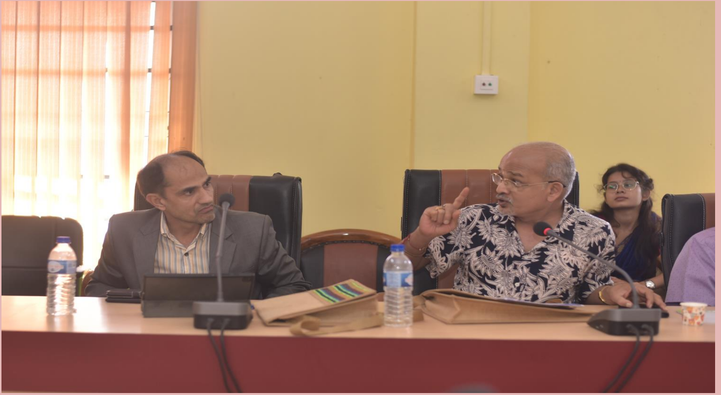
Discussion and Q/A during technical session-V of the National Conference