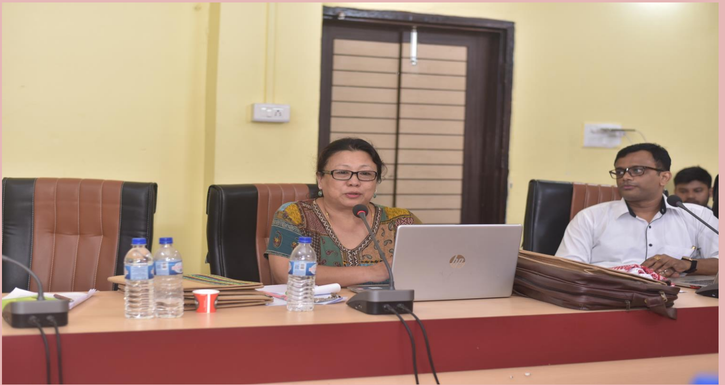
Speakers presented their paper during technical session-IV of the Conference