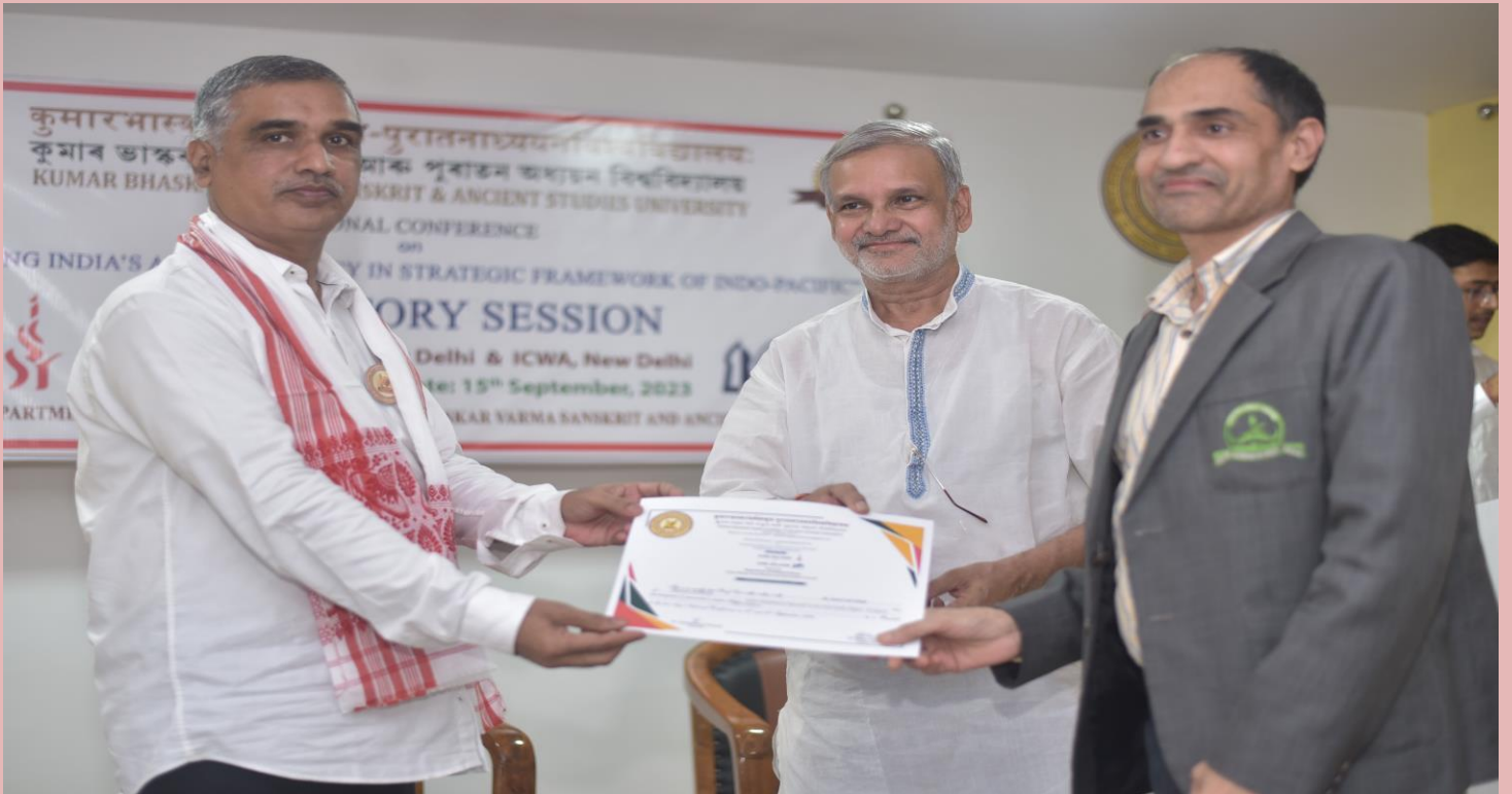
Distributing certificates to the speakers by Hon'ble Vice Chancellor and Valedictory Speaker