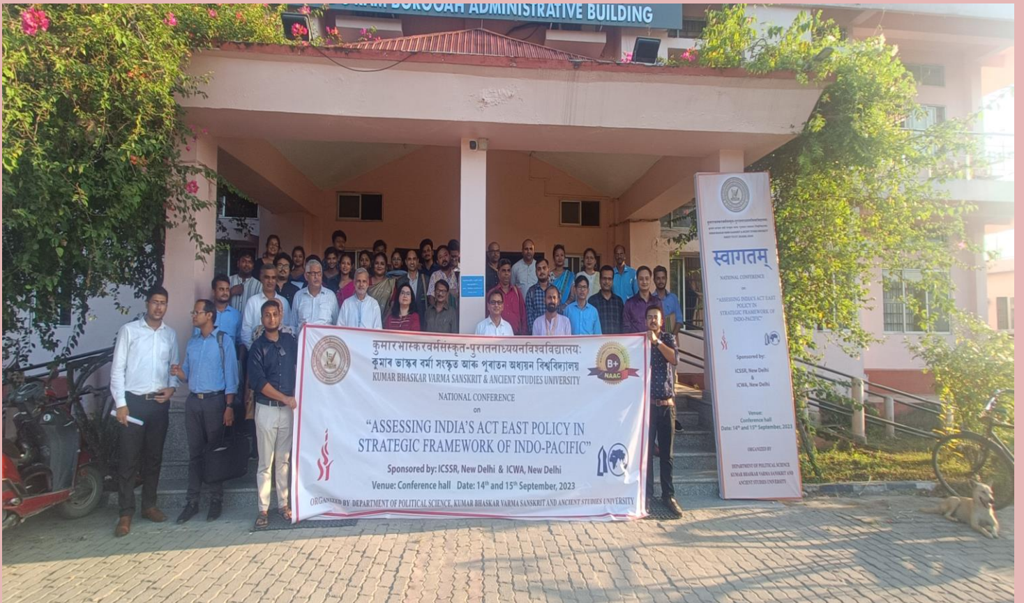
Honourable Vice Chancellor along with the participants of the National Conference