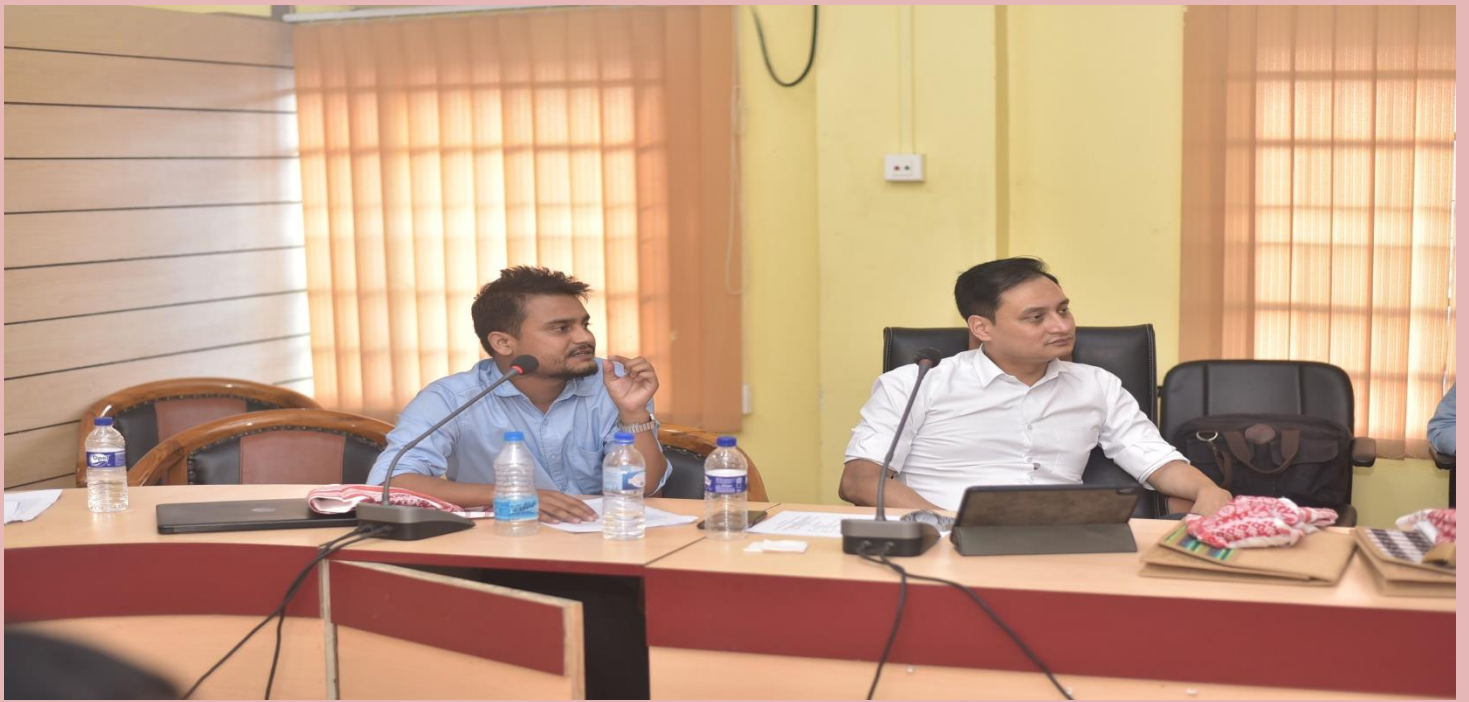
Second Technical Session of the National Conference