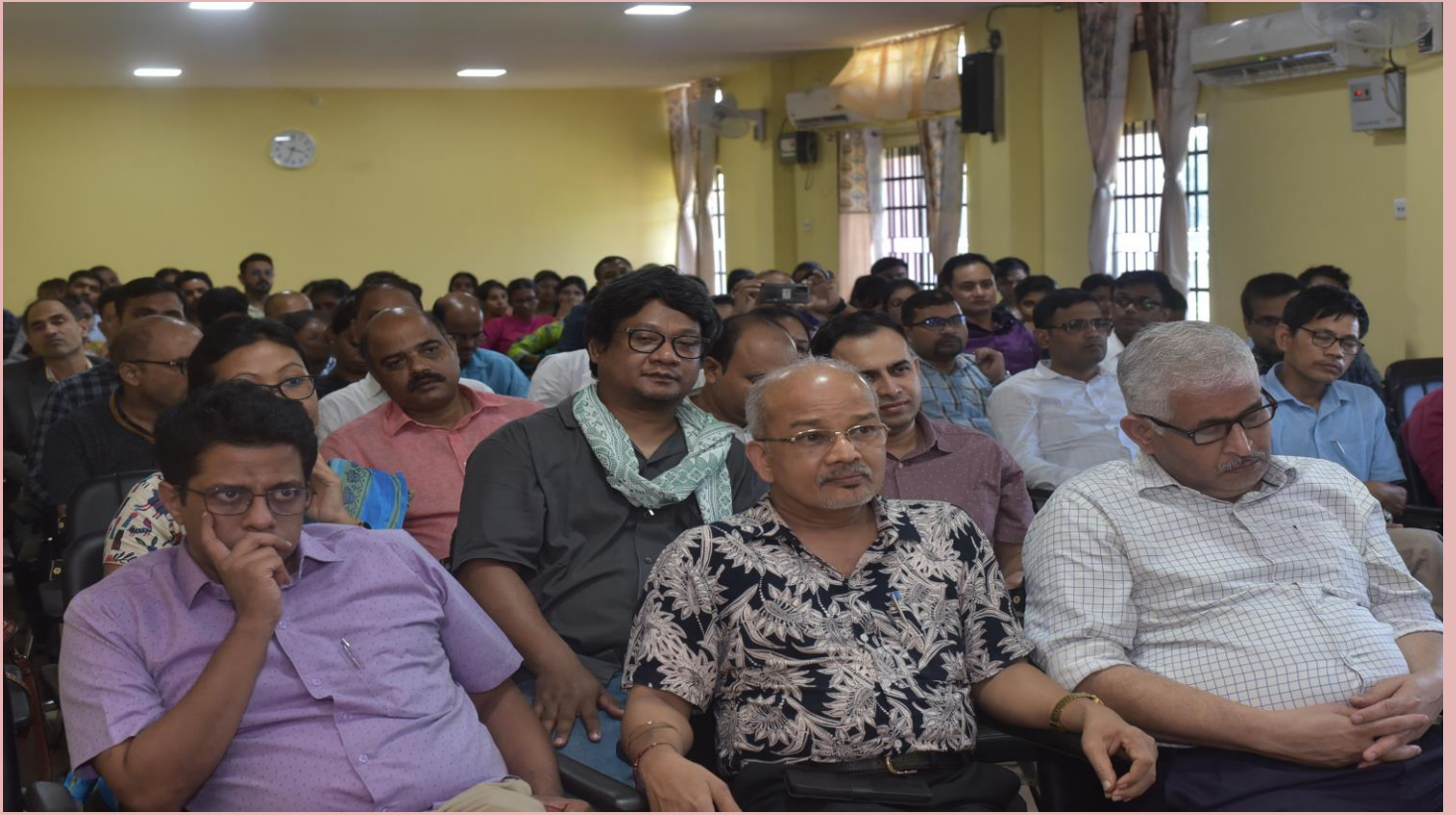
Invited guests and other dignitaries in the Valedictory Session of the Conference