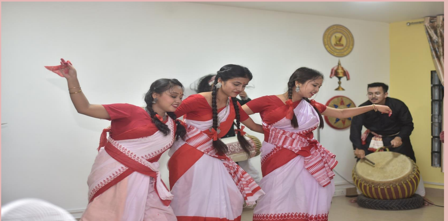
Showcasing rich culture of Assam during the cultural programme of the Conference