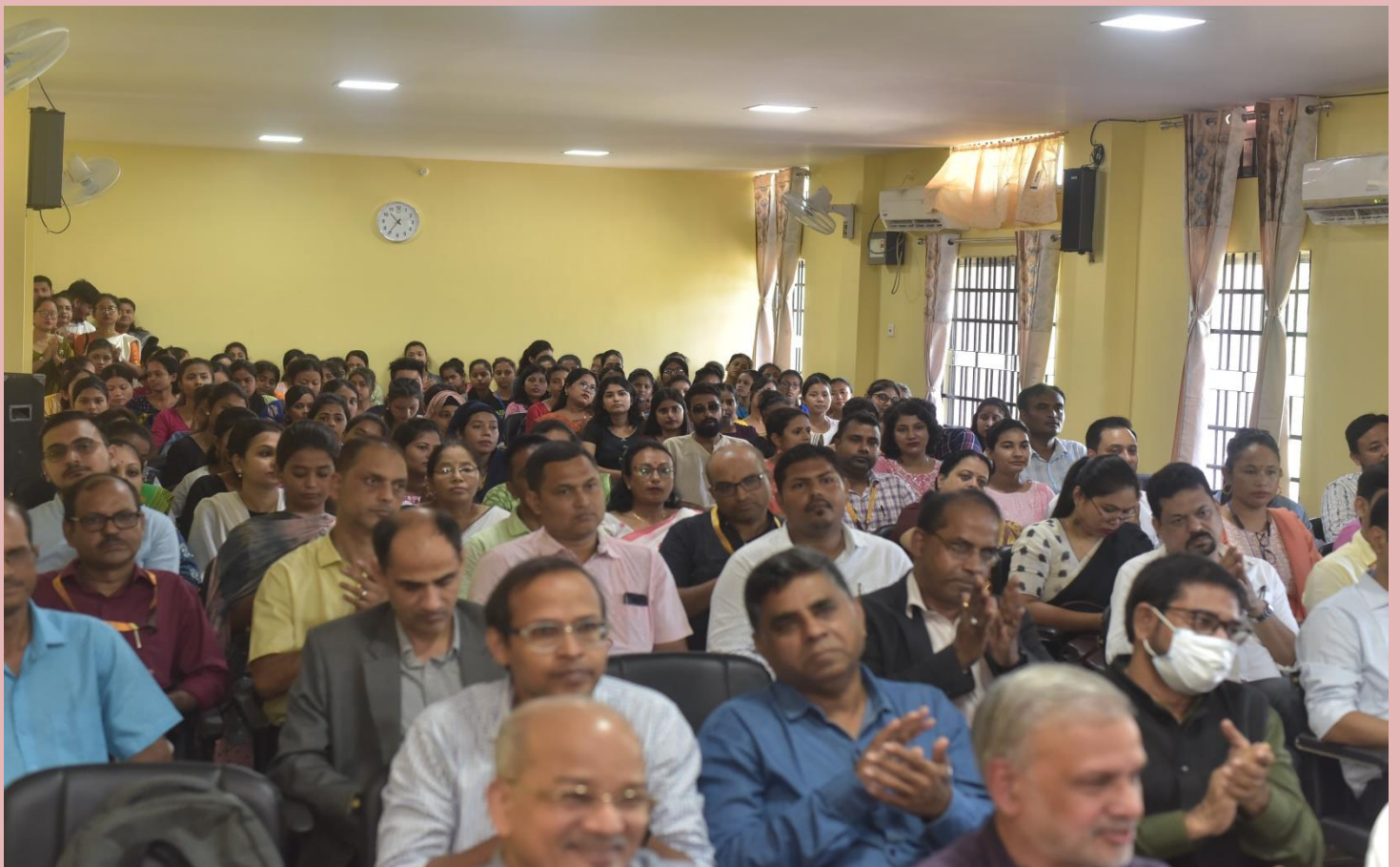
Faculty members, invited guests, research scholars and students attending the Conference