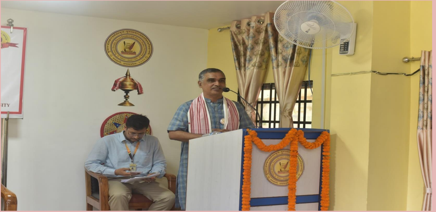
Hon'ble Vice Chancellor is delivering his inaugural address of the National Conference