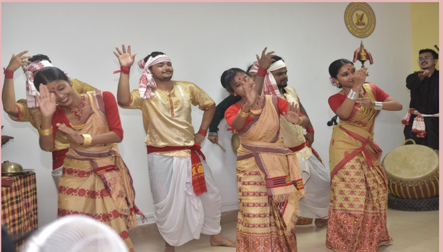
Cultural extravaganza performed by the students of the department of Political Science